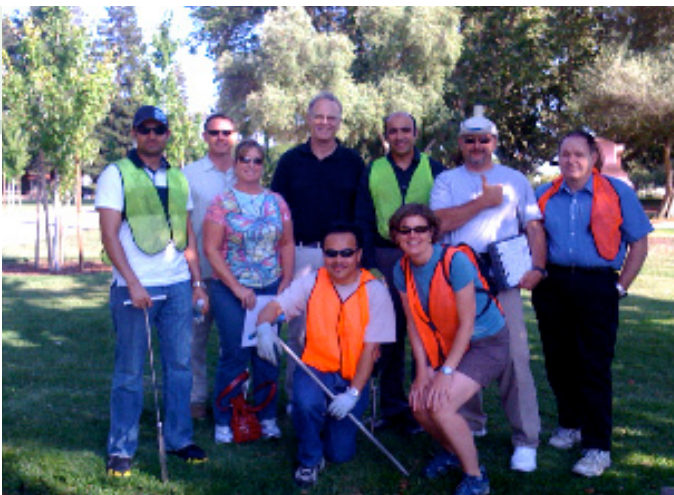
Volunteers from Memry Corp. completed several survey routes.

Katahdin Foundation Kiwanis Club of Palo Alto Palo Alto Community Foundation Patagonia PG&E Roche Rosewood Sand Hill The Garden Club of Palo Alto The Wildflower Fund