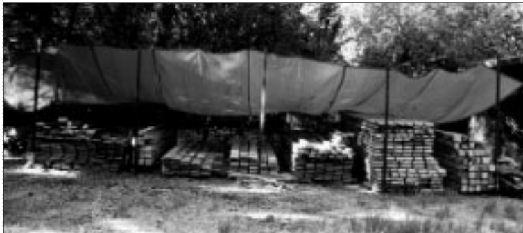
Over 4,000 board feet of lumber from a diseased Monterey pine are curing at the Atherton home of Ernie Goitein. Some of the lumber was also used to build a new picnic table which now sits in the garden in the same spot where the tree used to grow.

wood milled into useable lumber. After a series of phone calls, he found a company in Los Gatos that can send someone with a portable mill to cut up downed wood.