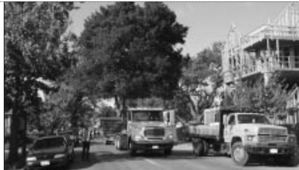
The moving tree gently embraces several liquidambers as it passes them on Channing.

About one and one-half blocks away is that “right place.” Also in the SummerHill development, it is in the future Homer Park, next to the Roth Building and across from the Museum of American Heritage.