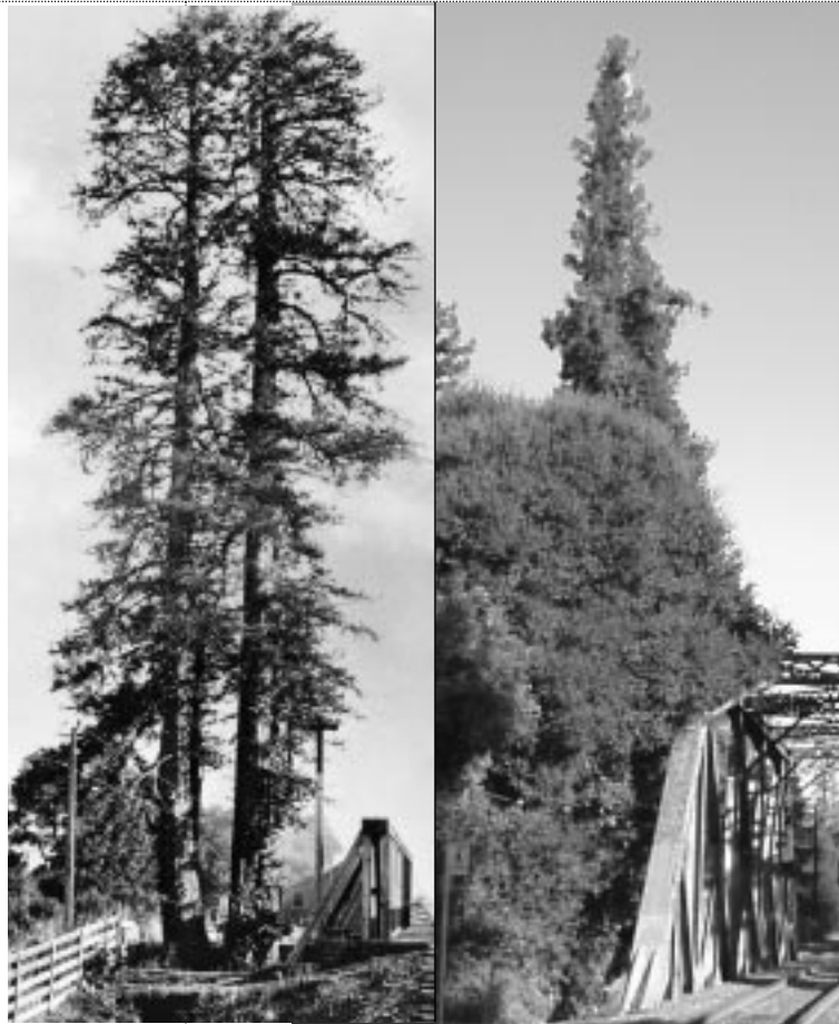
left: El Palo Alto as seen from the north in 1875. right: El Palo Alto as seen from the north in 2003.

steer us. El Palo Alto reminds us of the importance, beauty, and amazing longevity of trees. It reminds us that we must respect and care for trees in order to enjoy their beauty.