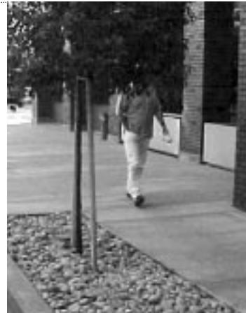
A tree growing in structural soil on Lytton Ave. in downtown Palo Alto.

installed. These include an office building where the parking garage extends beneath the sidewalk to the curb, and another garage where the use of structural soil allowed an s-shaped row of ginkgos to have a growing trough 15 feet wide.