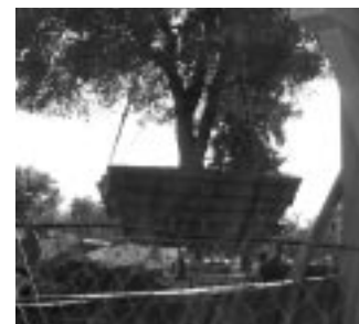
Oak tree briefly “gets air” before being gently lowered into its new surroundings.

From all appearances, the move was a success. The tree was planted in its new hole with the same north-south orientation it had at 819 Ramona. Since this is the time of year when oak (and other tree) roots are at their lowest activity level, it is hoped that the move was accomplished with minimum shock to the tree. The tree will provide the new park designers with an outstanding feature to work with. And it is expected to provide Palo Altans with increasing shade for at least another century to come. ■