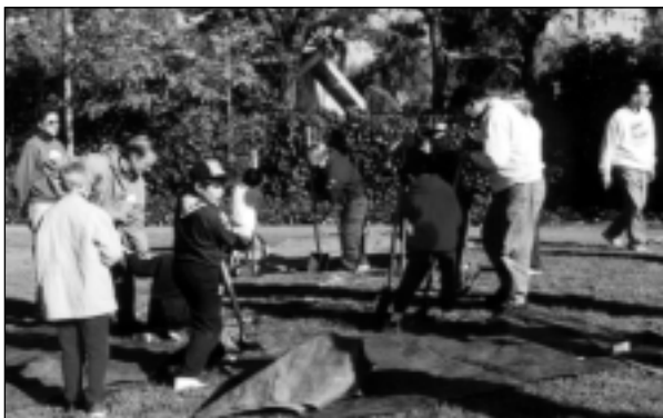
Cub Scouts from Pack 8, Troop 14 (Palo Alto) hard at work planting a grove of Coast Redwoods at Palo Alto's Boulware Park

We're looking for someone to come in weekly for 2-3 hours. Call Hal at 964-6110.