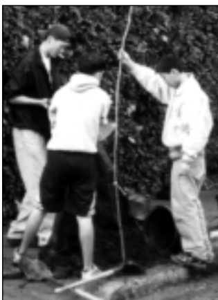
Gunn High School Key Club members plant a Chinese Pistache on High St.