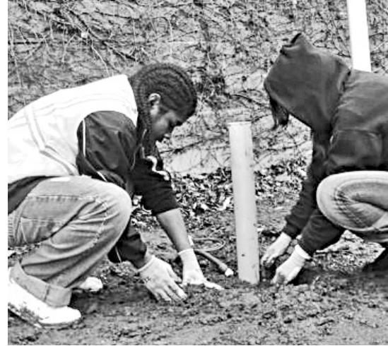
Youth planting along sound wall, East Palo Alto. Tubes shelter for growing tree seeds.