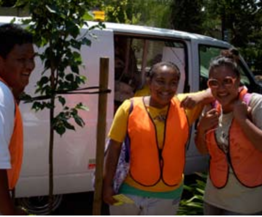
Youth Community Service Volunteers join Canopy's Palo Alto Young Tree Care Survey in July.